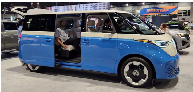
VW ID Buzz