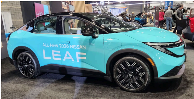
Nissan Leaf with two separate charging ports