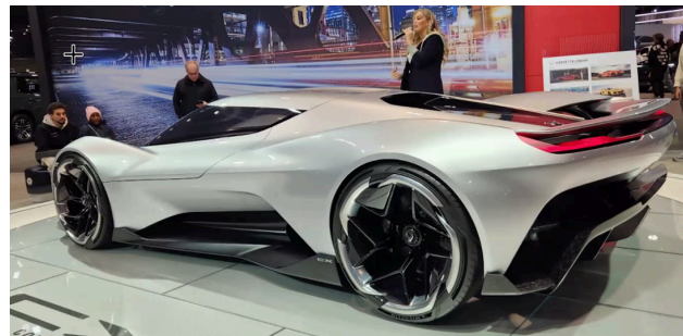
Corvette CX Concept Car