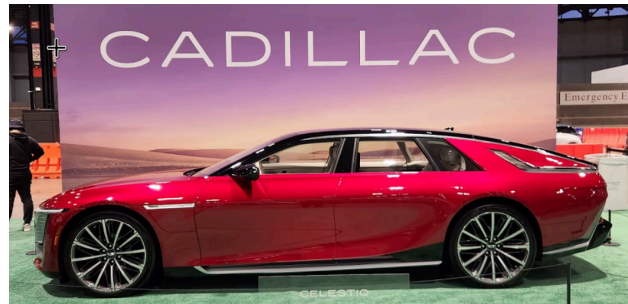
Need we say more?