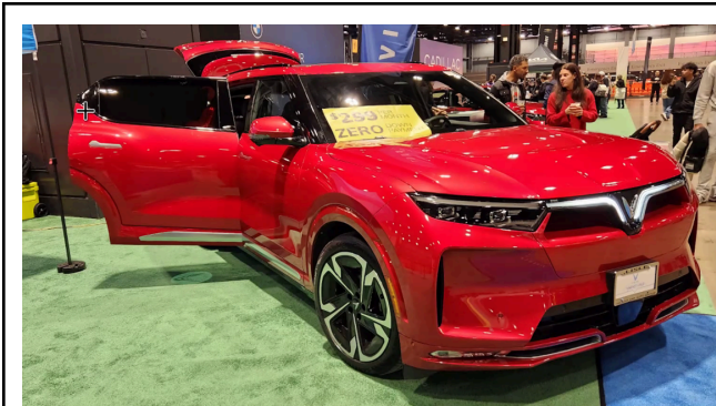
Vinfast VF7 (South Viet Nameese)