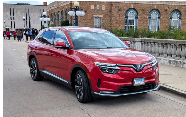
Judd Lofchie's Vinfast EV