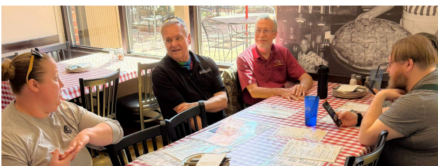
Pizza Lunch at Aurelios in Geneva after the morning drives.