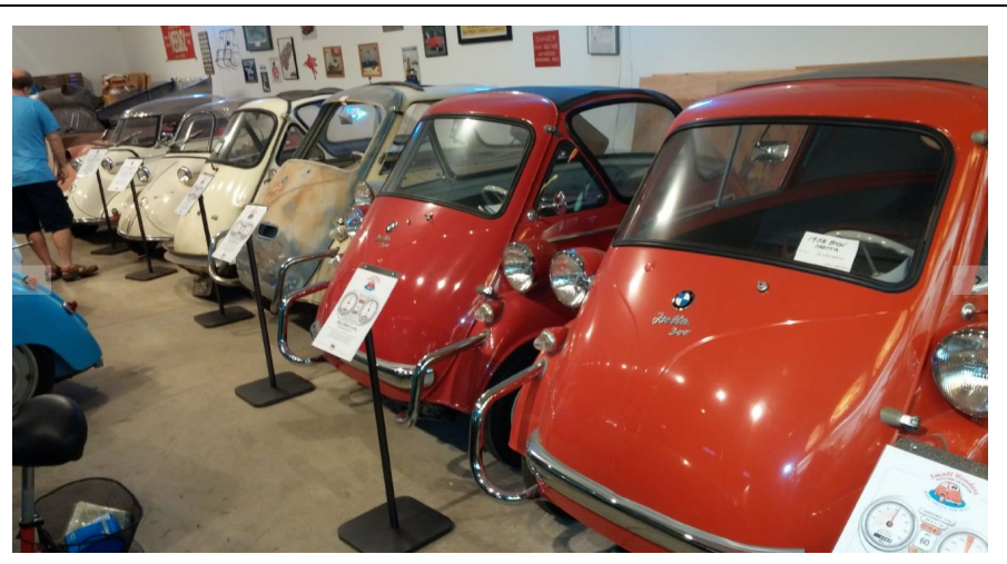
Row of early Isettas