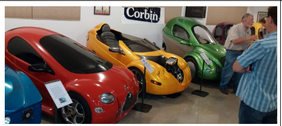
Beautiful Corbin Sparrow / Myers Motors NMGs (No More Gas) electrics on display