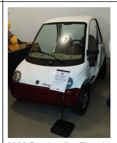
2000 Bombardier Electric