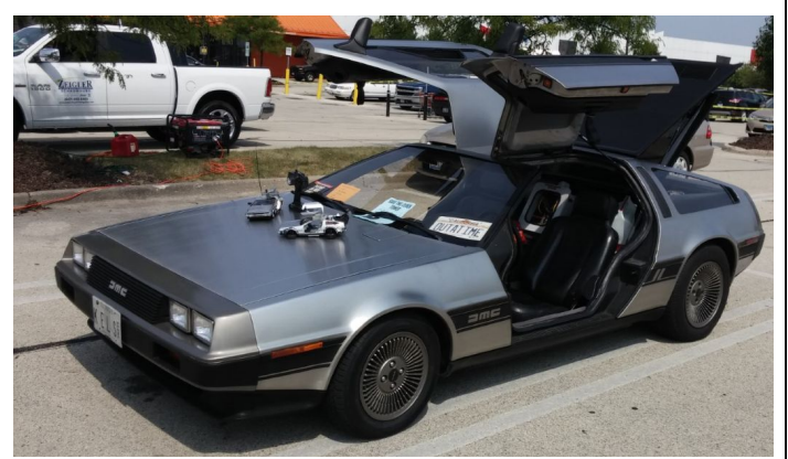
Delorean w FLux capacitor! Well, it was a running Delorean anyway