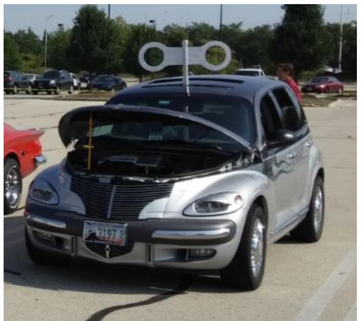
Even more efficient than an EV? Just wind it up and let er go !?!?