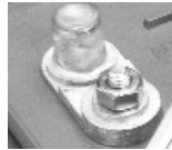
Embedded AP with Stud Terminal (EAPS)