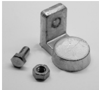
"L" Terminal (LT)