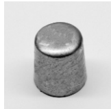
Automotive Post (AP)