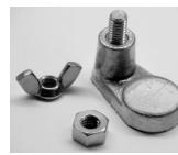
Wingnut Terminal (WNT)