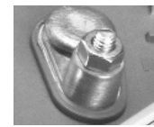
Embedded Low Profile Terminal (ELPT)

AVAILABLE FROM TROJAN MASTER DISTRIBUTORS WORLDWIDE