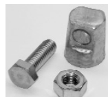
Universal Terminal (UT)