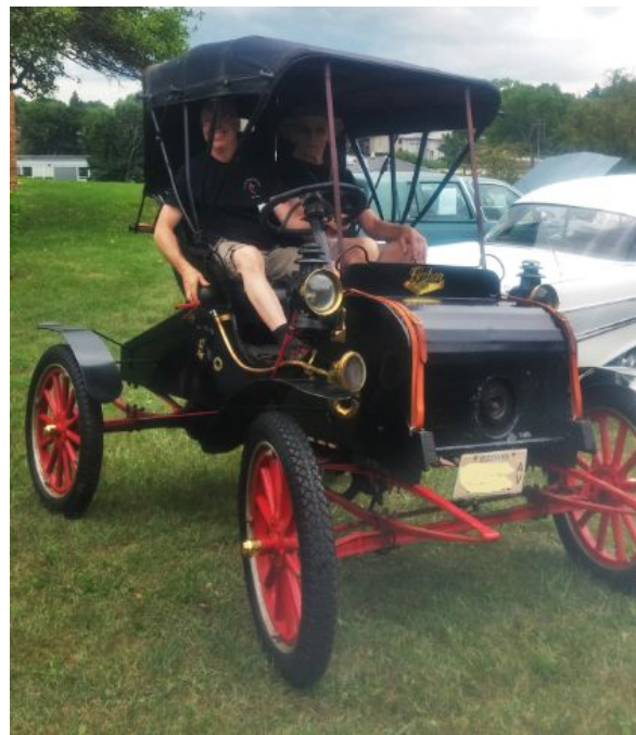
Bob's Circa 1903 antique vehicle