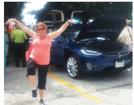
Love those Model X Gull Wing doors!