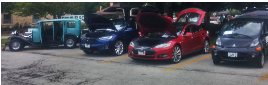
A beautiful day at the Green Fair on the Fox Aug. 13, 2016