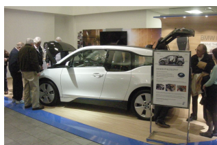
The electric i3 on display