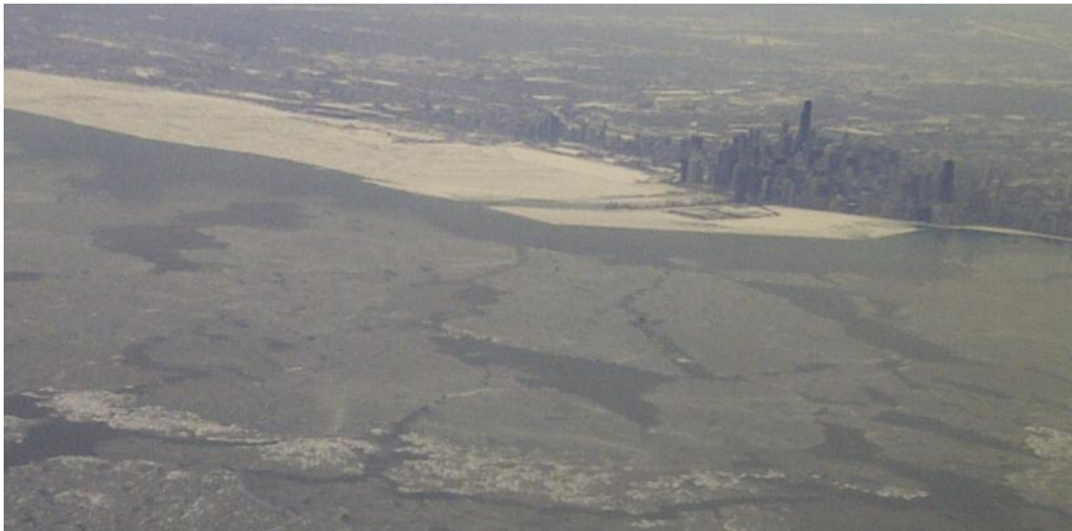
Frozen Lake Michigan

Hope you all are hanging in there this winter and keeping warm. Has it ben cold or what? j just flew into O'Hare Saturday night and Lake Michigan was mostly frozen over. Here's a shot of Chicago as the plane approached the airport. Another headline I saw in the paper stated that most of the Great Lakes are mostly frozen.