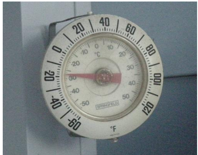
So how cold was it that third week in January?