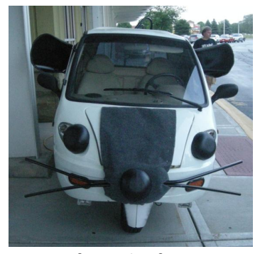
Mousie from the front