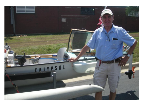
Solar Powered Canoe from "Calypsol"