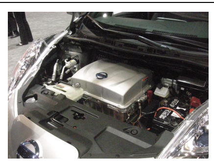
Nissan Leaf Inverter moved from trunk to top of motor providing more trunk space.

$28,800 and the "SL" at $35,000+. The SL has a lot of very nice features including leather seats, a new "all-around" video surveillance system with 5 cameras showing the driver every outside corner of the car for improved visibility. They moved the inverter from behind the back seat to the front motor area, adding more room to the rear cargo bay. The car is lighter and has an ultra light Bose sound system. I liked the new styling too, and at $28,800 the basic model S price drops to around $20k after Federal $7,500 tax credit and 10% Illinois EPA Green Fleets rebate. Not bad!