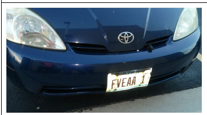
Steve's historically significant license plate