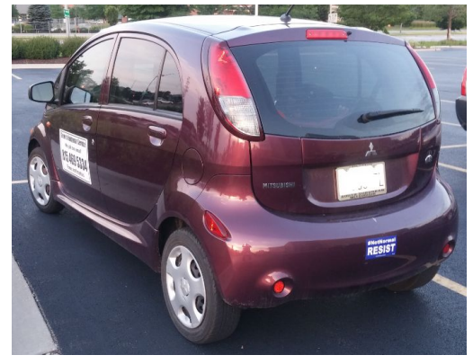
Jeff Green's iMiev looking sweet