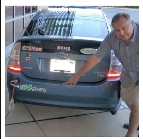
That still gets over 100 miles per gallon