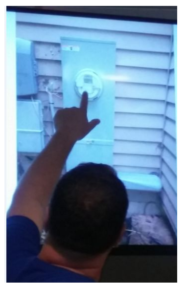
320amp meter that ComEd installed