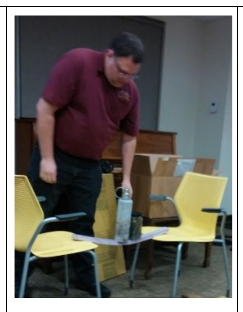
A strip of foam wrapped in brown paper or tape is pretty strong!