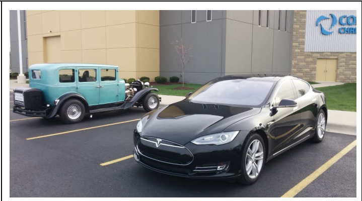
Plug-in hybrid Hupmobile hot rod and beautiful black Tesla Model S