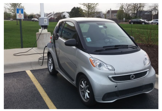
Fred's Smart For2