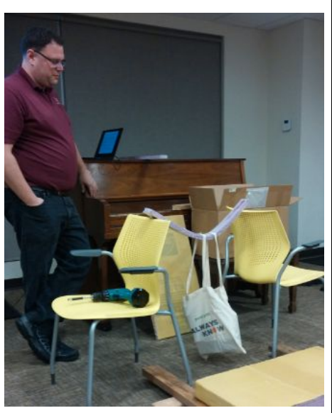
And even stronger with several pieces of tape