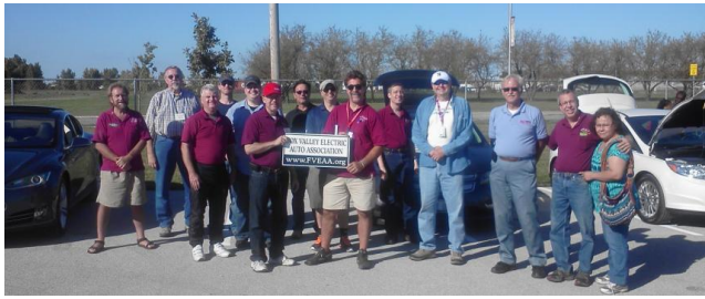
National Plug-in Day Sept. 29, 2013