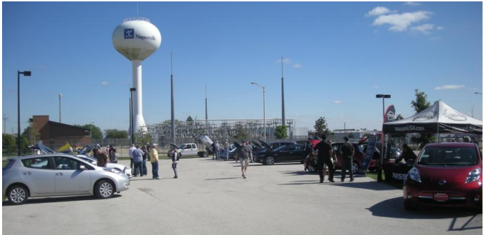
NPID at the Naperville car test track 1720 West Jefferson.