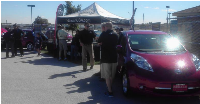
Nissan booth with 5 Leafs